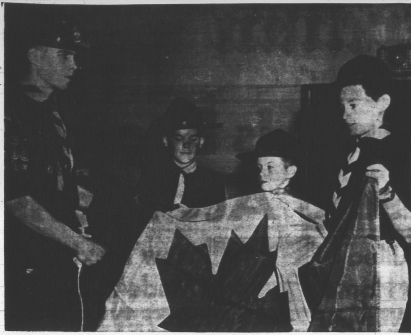
MP DONATES FLAG TO TROOP

Members of the 1st Montague Boy Scout troop examine the new maple leaf flag which was sent to them