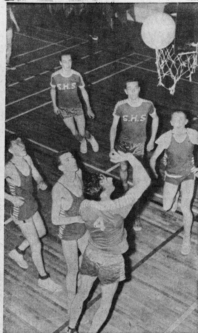
P. W. C. WINS TITLE

An action shot taken during Friday night's game at Summerside Civic Auditorium when the P.W.C. second team won the Island Intercollegiate Basketball Title. Summerside High won the contest 59 to 53 but lost the total goal series 108 to 101.