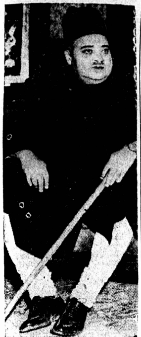
NEW PREMIER OF PAKISTAN

Sir Khwaja Nazimuddin, seen above, governor-general of Pakistan, has resigned to take over the reins of the government as acting Prime Minister following the assassination of Liaquat Ali Khan.