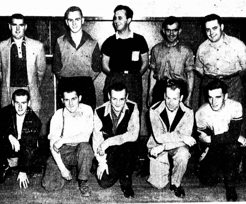
Pictured above are the members of the Charlottetown Fire Department's Track team who left over the week-end for the annual Maritime Invitation Pre-men's Meet held this year at Lunenburg.