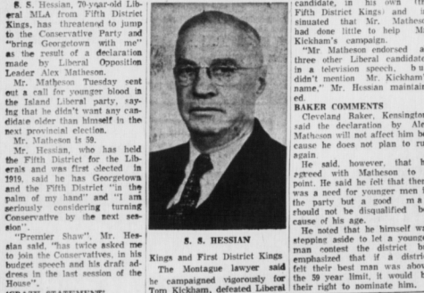
S. S. HESSIAN

Means rich in iron, particularly valuable for anemia, patients suffering had his case of kidney, tongue, brain and heart.