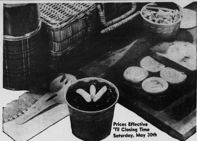
Prices Effective 'Til Closing Time Saturday, May 30th

ACREAGE DESTROYED — During the 1963 Ontario fire season, 122 forest fires in the province burned a total area of 38,604 acres.