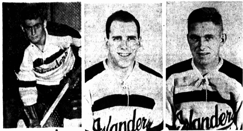
Stars Of Last Night's Game