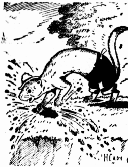
He was trying to dig a hole.

"Why work when someone else will do it for you?" says Billy. Usually this plan worked very well, but now and then there was a time when he wanted a hole and there was no one around to do the digging for him. This was one of them. Down in the ground right under him was the home of Rattles the Kingfisher and in it were Rattles' children, how many he didn't know. That there were a lot of them he knew by the cries