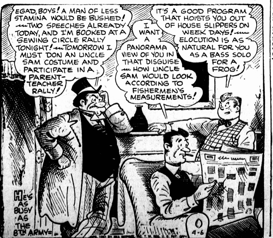
HE'S AS BUSY AS THE 8th ARMY