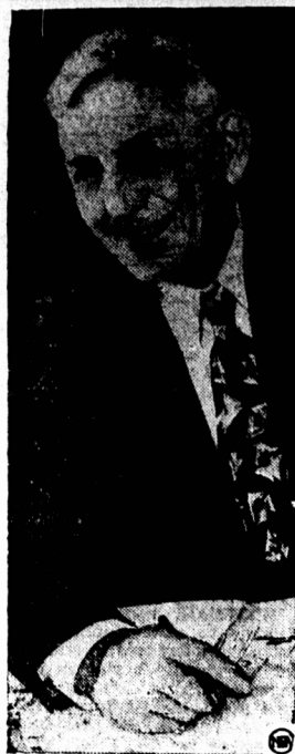
J. R. WILLIAMS: He'd rather be a successful cowman.

(By NEA Service) NEW YORK—(NEA)—A panorama of the color and humor of the American West, as portrayed by one of the world's best known and best-loved cartoonists—J. R. Williams—is on display in the just-published book, "Cowboys Out Our Way" (Charles Scribner's Sons, $2). Readers who have enjoyed Williams' "Out Our Way" cartoons on the comic page of The Guardian will find many of their favorites reproduced in this new collection. The book includes 192 of the cowboy drawings which have entertained millions of newspaper readers during the last 29 years. Jim Williams started drawing "Out Our Way" in 1922. His work now appears in more than 1000 daily and Sunday newspapers. All of the famous Williams cowpuncher characters appear in this collection: Curly and Stuffy; Wes, the reformed tenderfoot; Big Ick; Sugar, the unpredictable cook; Soda, the pipe-smoking cowhand; and others. Nearly every page features the amazingly lifelike horses and cattle, drawn as only Jim Williams can draw them. Says J. Frank Dobie, celebrated western authority and writer, and university professor, in the book's foreword: "The characters come out of two deeply seated realities in their creator: his own experience on the range and his dreams of a free life in the open. Over years of time Jim Williams has