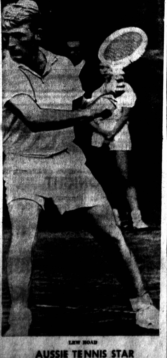
LEW HOAD AUSSIE TENNIS STAR