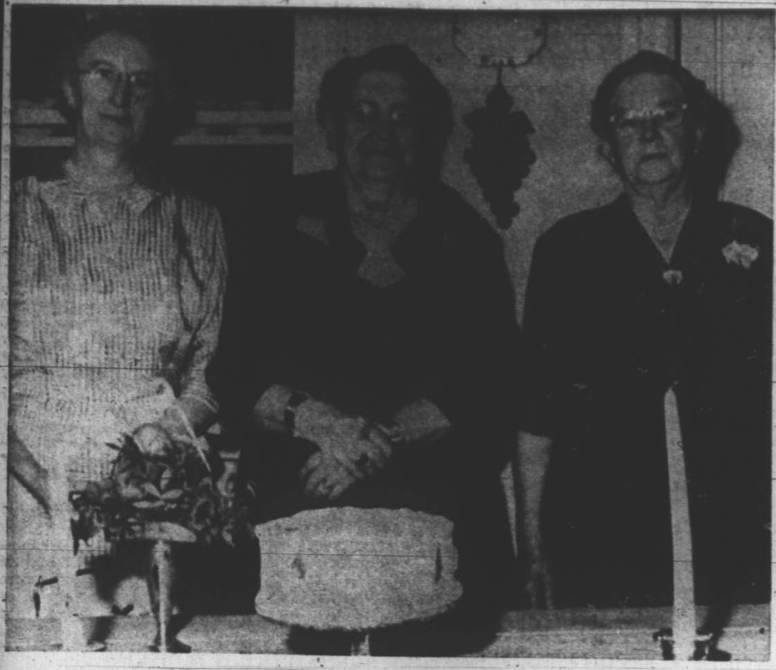
CHARTER MEMBERS SUMMERFIELD W.M.S.