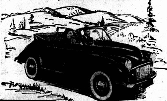
The MORRIS MINOR

$100 takes you 100 miles (ACTUAL TEST) in the NEW 1950 MORRIS CARS