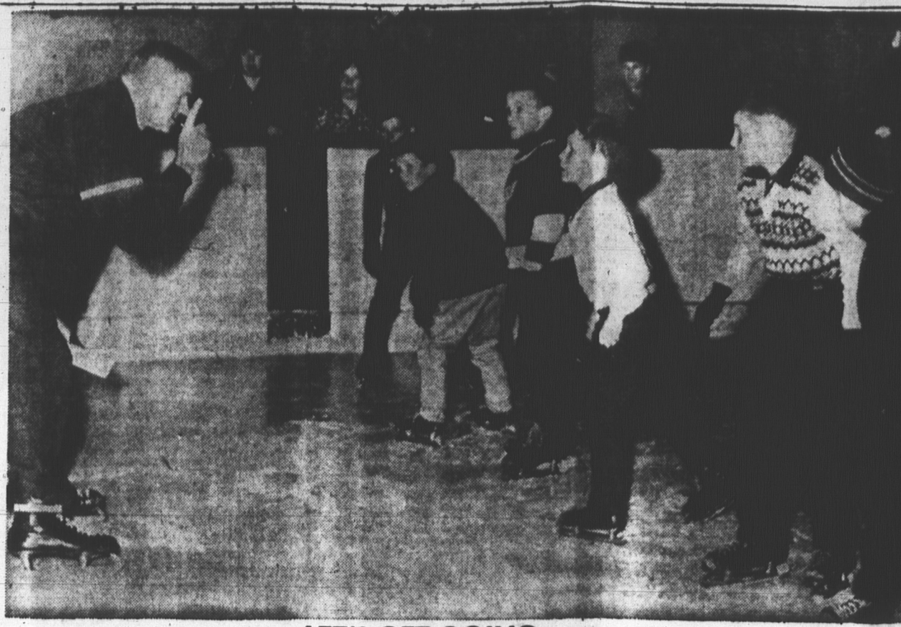
LET'S GET GOING

This is a club that will not be outmanned by any opposition and they have plenty of goalkeepers in the lineup.