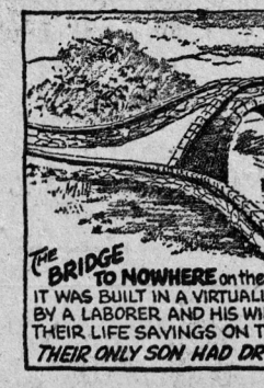
BRIDGE TO NOWHERE. On the 15th River with Sutherland, it was built in a virtually inaccessible spot by a laborer and his wife who expended their life savings on the project because their only son had drowned at that spot.