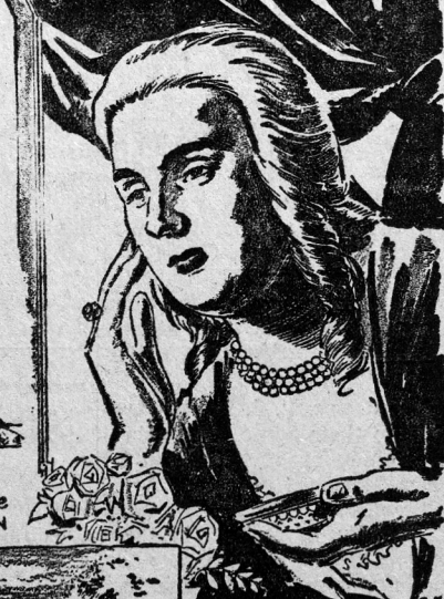
EMPERESS ANNE (1690-1740) WHO RULED RUSSIA FROM 1730 TO 1740 NEVER WASHED OR BATHED. OCCASIONALLY SHE DAUBED MOLTEN BUTTER ON HER HANDS AND FACE.