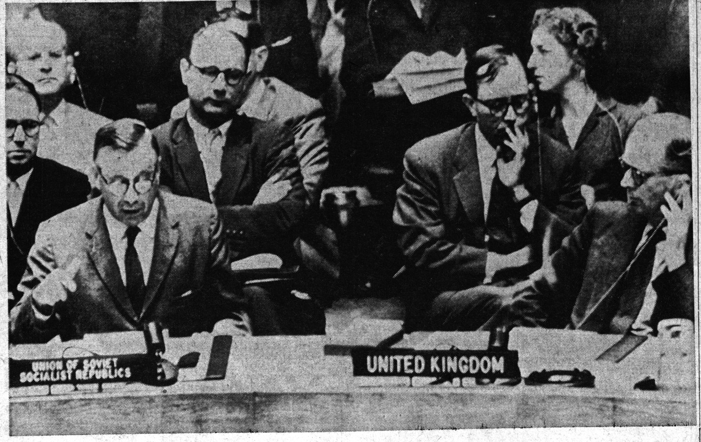
RUSSIAN DELEGATE EMPHASIZES DEMAND

The 32-year-old monarch has had a series of progressively heavier colds since last December.