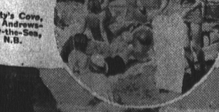
Katy's Cove, N. Andrews-by-the-Sea, N.B.

● Canada offers infinite variety. Its Banff and Yoho National Parks in the Rockies are royal playgrounds for bracing holidays. Banff has the finest mountain golf course in North America. The new spectacular Columbia Icefield Highway runs north from Lake Louise, flanked by scores of glaciers. The Pacific Coast is an evergreen playground. A voyage to Alaska and the Yukon skirts fjords and glaciers. Ontario's forests, lakes and streams offer many delights. Quebec has its Laurentians and resorts with a rich background inherited from the first French settlers. The Maritimes boast delightful summer colonies such as St. Andrews-by-the-Sea and Digby.