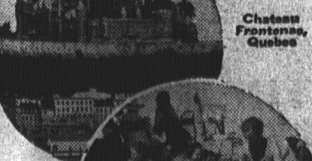
Chateau Frontenac, Quebec