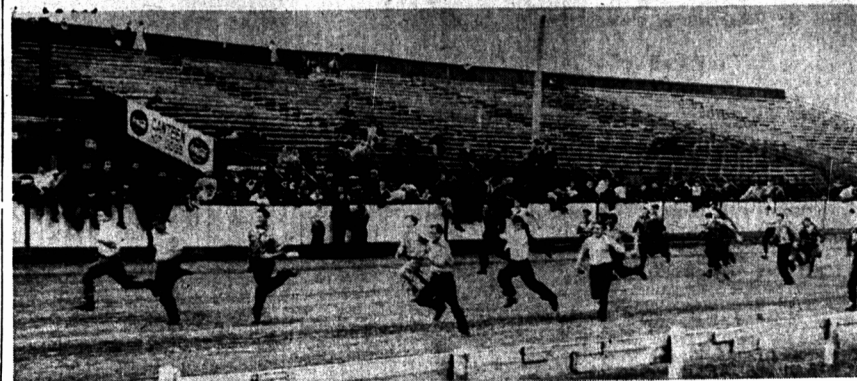
Competition was very keen in all the track and field events held yesterday at the Rural Youth Fair. Seen above are a group of boys speeding for the finish line.