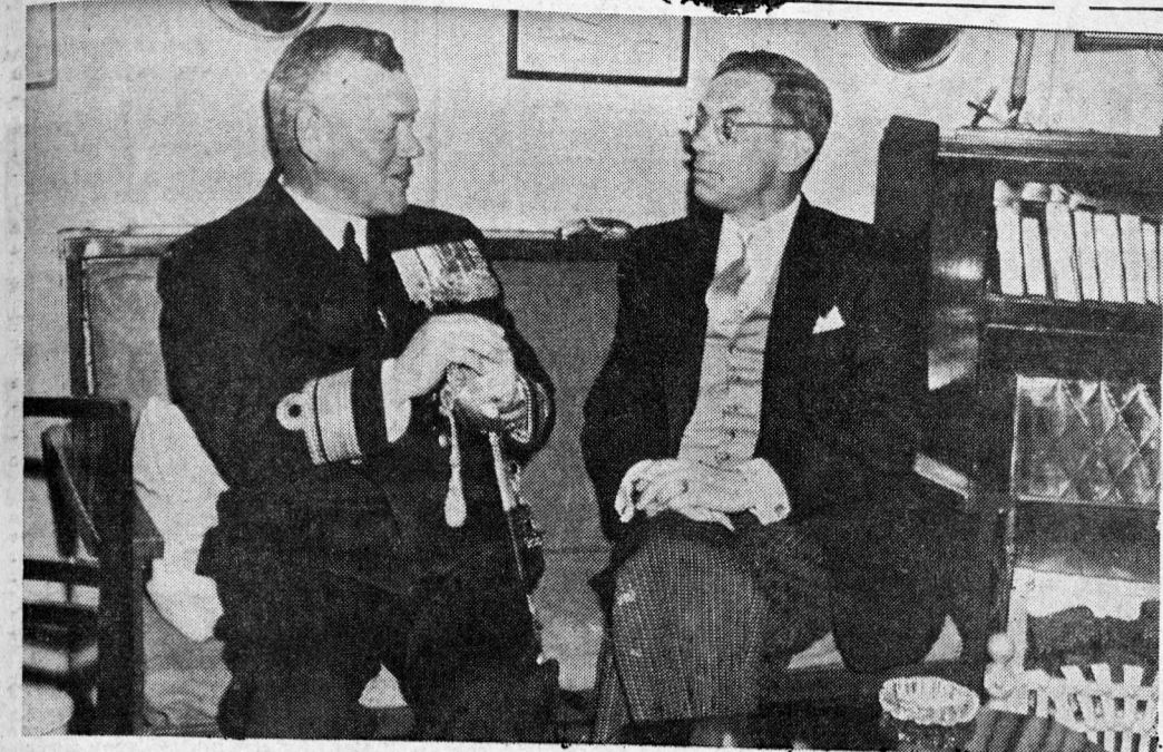
IN HIS CABIN aboard the Tribal Class destroyer, H. M. C. S. Sioux which docked at the Marine Wharf yesterday, Rear-

Buyer meets seller with Guardian Want Ads. Dial 8506 ask for classified ad taker, for quick results.