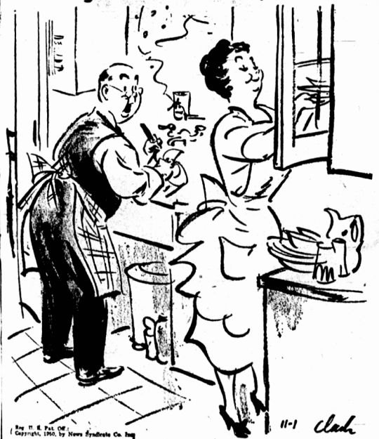
"Don't be too sure the Army doesn't want men my age. Fellows like MacArthur and Bradley are doing all right!"