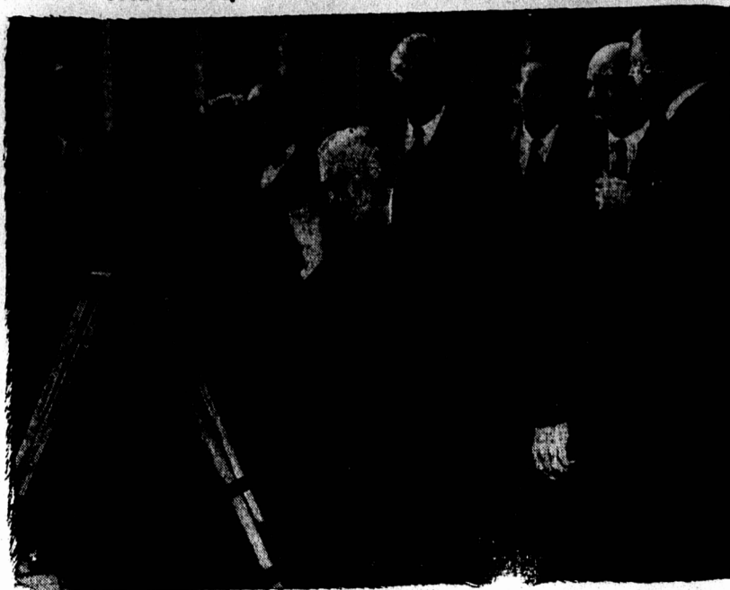
Delegates to the Federal-Provincial conference in Quebec City may have been looking for the terms of the new Canadian constitution as they viewed the city through this telescope.

said he believed agreement can be reached whereby the Provinces will have some authority in Federal affairs.