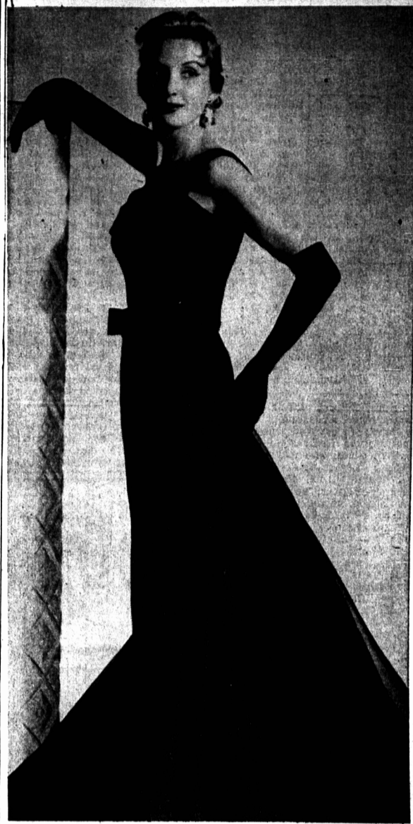
This back-swept evening gown, shown in Montreal at the first fashion show of the Canadian Association of Couturiers' contain 30 yards of black nylon sheer. Named Ala Nera, Italian for black wing, the rest of the dress is molded of slim-fitting wool broadcloth cut with a high square neckline. (CP Photo).