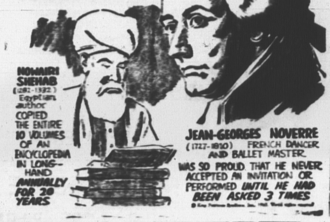
JEAN-GEORGES NOVERRE (1732-1810) FRENCH DANCER AND BALLET MASTER. WAS SO PROUD THAT HE NEVER ACCEPTED AN INVITATION OR PERFORMED UNTIL HE HAD BEEN ASKED 3 TIMES