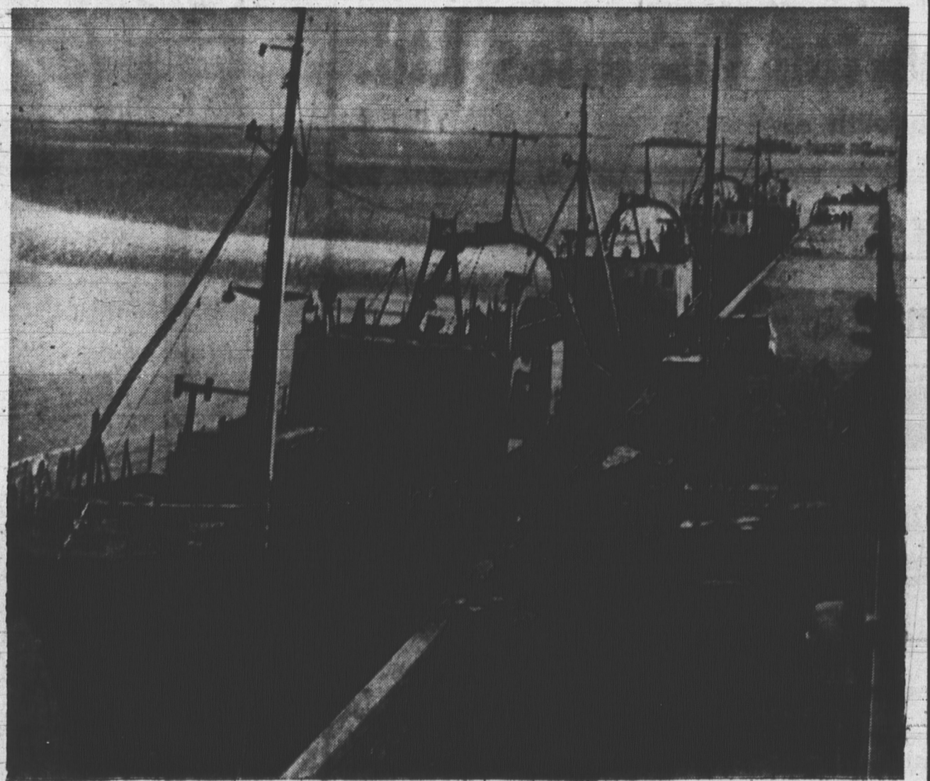
QUARTER-MILLION POUNDS FISH LOADED AT GEORGETOWN

Gulf Garden Foods Ltd. trawler fleet of four ships, the Gulf Guard, Gulf Gallant, Gulf Gull and Howe Bay, seen here sailed into Georgetown Harbor Tuesday, April 5th, 1966 from the fishing grounds off St. Paul's Island. They had been fishing on Brown's Bank out of the port of Shelburne, N.S., since mid January and now have returned to fish gulf waters out of their home port of Georgetown. Unloading operations of the 250,000 pounds of fish brought here by the trawlers began immediately.