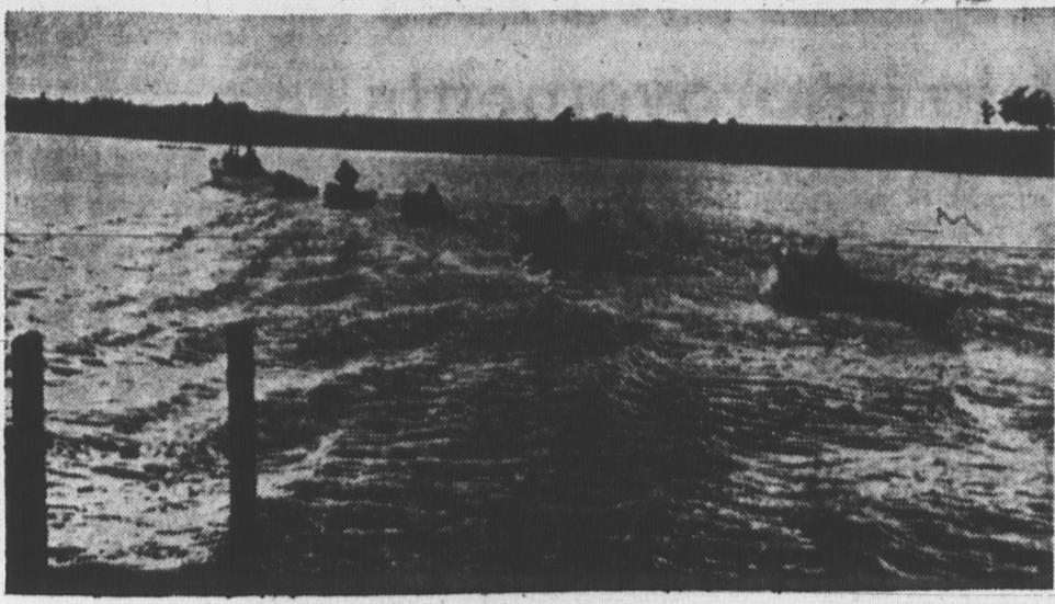
HEADED FOR MALPEQUE OYSTER BEDS