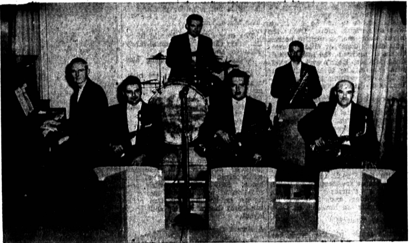
Music by the "Legionaires"