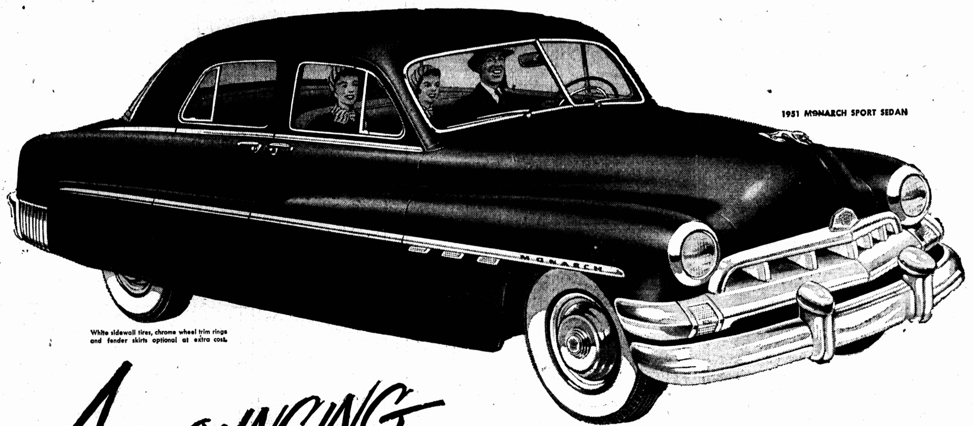
1951 MONARCH SPORT SEDAN

117-115 Grafton Street Room 2, Phillips Bldg. Phone 2992 CHARLOTTETOWN, P.E.I.