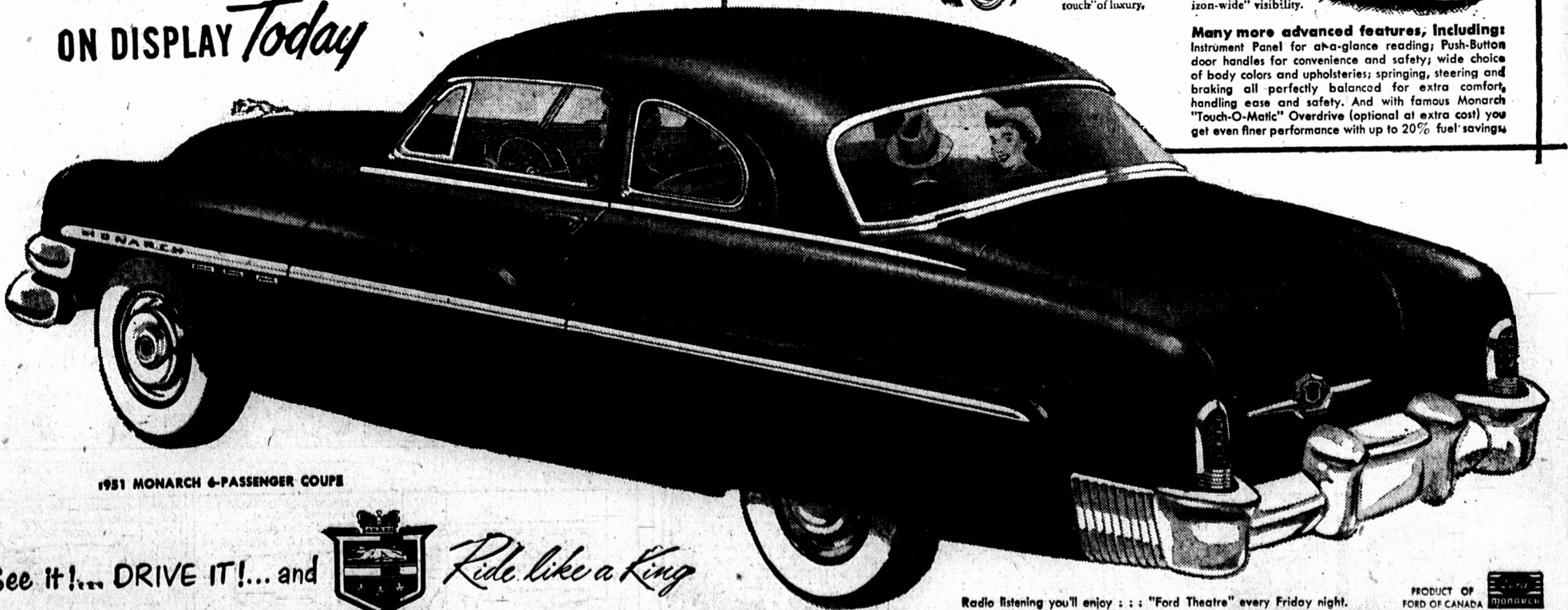
1951 MONARCH 6-PASSENGER COUPE

Many more advanced features, including Instrument Panel for at-a-glance reading; Push-Button door handles for convenience and safety; wide choice of body colors and upholstery; springing, steering and braking all perfectly balanced for extra comfort, handling ease and safety. And with famous Monarch "Touch-O-Matic" Overdrive (optional at extra cost) you get even finer performance with up to 20% fuel savings!