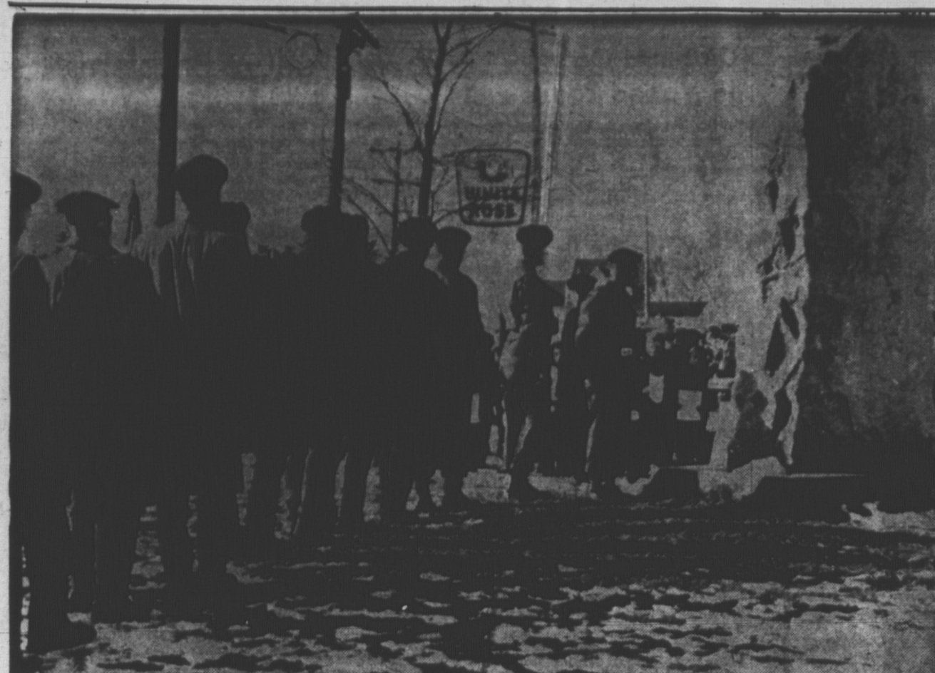
TYPICAL OF Remembrance Day ceremonies carried out in the province yesterday is this one that took place at St. Eleanors. Across the province, war veterans, their relatives and friends, paid homage to those who gave their lives defending the democratic way of life.