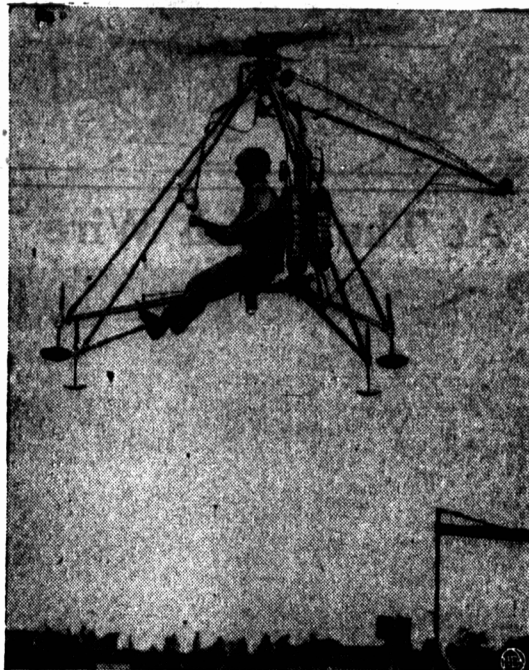
The first U. S. rocket-powered helicopter, the RH-1, hovers in flight as it undergoes flight tests at the Los Alamos Naval Air Station, Calif. The one-man craft was designed and built by the Rotor-Craft Corporation of Glendale, Calif.