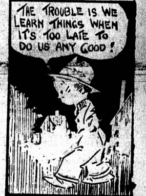
THE TROUBLE IS WE LEARN THINGS WHEN IT'S TOO LATE TO DO US ANY GOOD!