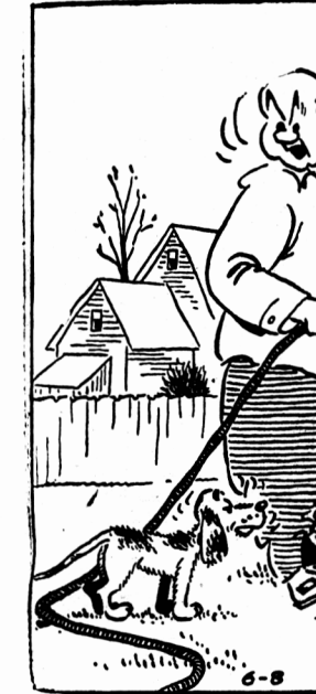
"Smoking in bed again!—and when I bought you, the Guardian Want Ad said you were well trained!"