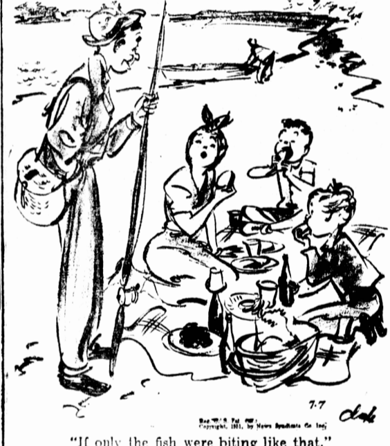
"If only the fish were biting like that."