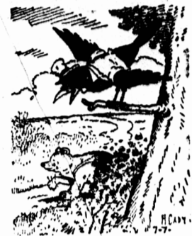
For a long time he stood there just looking and listening.

Buster Bear really was in trouble. One of his big paws was very, very sore. It hurt to use it in walking. In it were some of Prickly Porky's little spears which are called quills. He hadn't been able to get them out. They worked in deeper and deeper. The deeper they got the worse that paw felt. He couldn't use it. No, sir, he couldn't use it. He couldn't take a step with it. He couldn't dig roots with it even in the softest earth. He couldn't use it to tear old stumps to pieces after Ants or Mice. He couldn't use it to climb a tree after the honey that Busy Bee and her sister workers had stored in a hollow high up in that tree. He had found that tree after that paw had become sore. There's nothing in the world Buster loves quite so much as he does honey. So perhaps you can guess a little bit of how Buster felt sitting at the foot of that tree looking up from the board and took the trick with the ace. (He had a plan which involved the subsequent use of that spade card.)