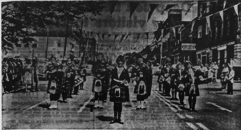
ANNUAL CONCERT WILL FEATURE FAMED LOVAT SCOTS BAND