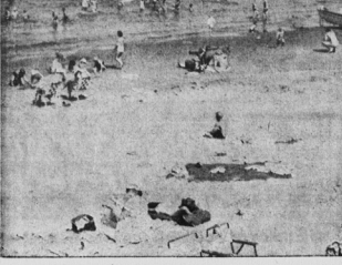
WARMEST WATER NORTH OF FLORIDA