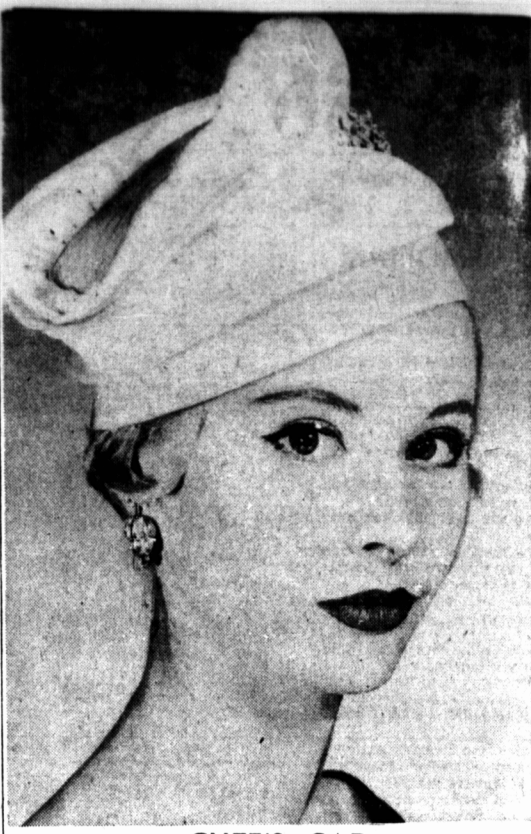
CHEF'S CAP This white satin is a creation centered with a large rhinestone pin; from Mr. John's junior collection, it's a new place to wear your cap. The softly draped crown is accented with a large rhinestone pin; from Mr. John's junior collection, it's a new place to wear your cap. The softly draped crown is accented with a large rhinestone pin; from Mr. John's junior collection, it's a new place to wear your cap.