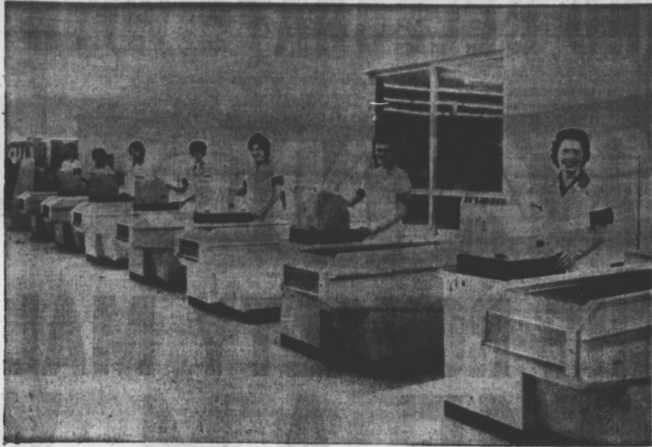
SEVEN CHECKOUTS WILL SPEED SERVICE