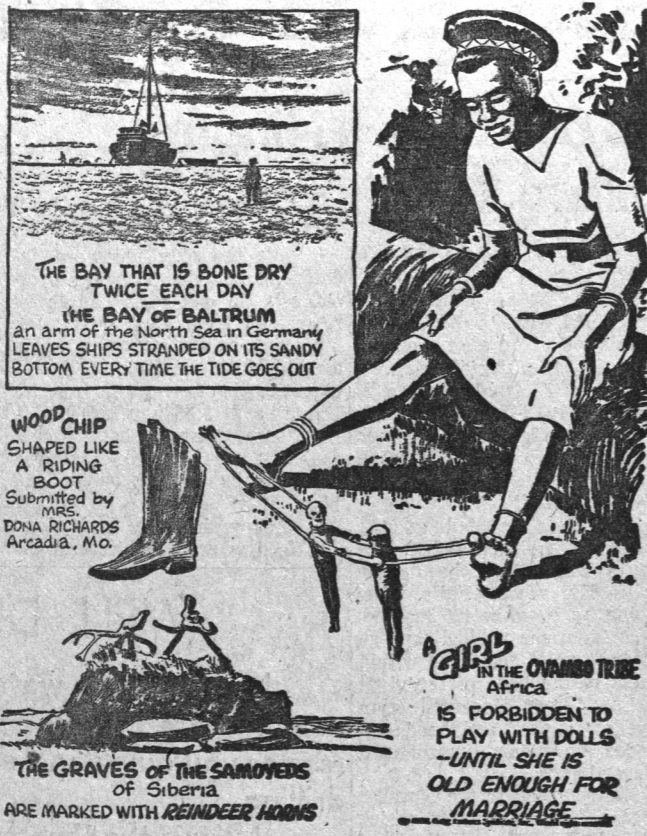
THE BAY THAT IS BONE DRY TWICE EACH DAY