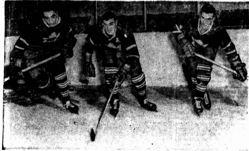
Toronto's Trigger-Happy Trio