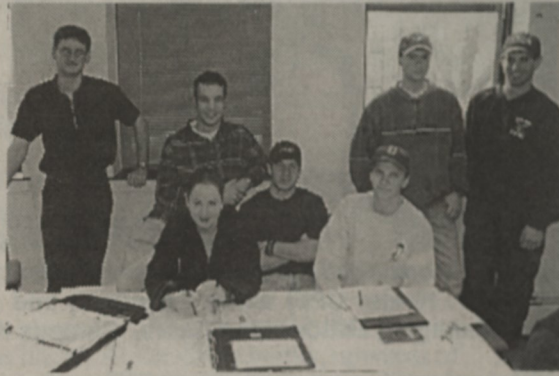
2nd Year Engineering Students

"No. In Buisness we have lots of time at end of classes to review."