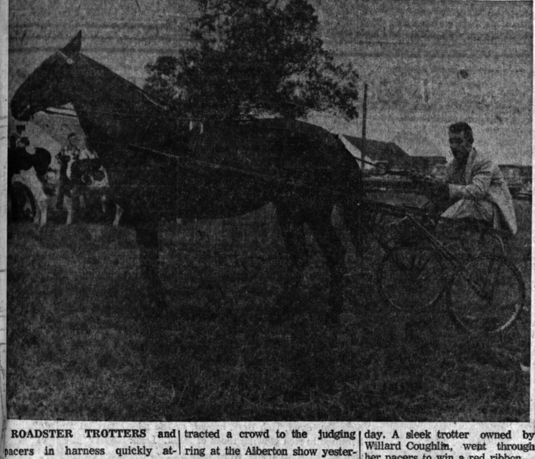
ROADSTER TROTTERS and pacers in harness quickly attracted a crowd to the judging ring at the Alberton show yesterday.