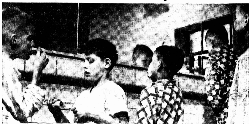
At Father Flanagan's famous Boys Town, Chlorodent proves twice as effective!

In the first major research chlorophyll toothpaste, dentists at famous Boys Town, Neb., discovered that Chlorodent brings "striking" improvement in mouth health.