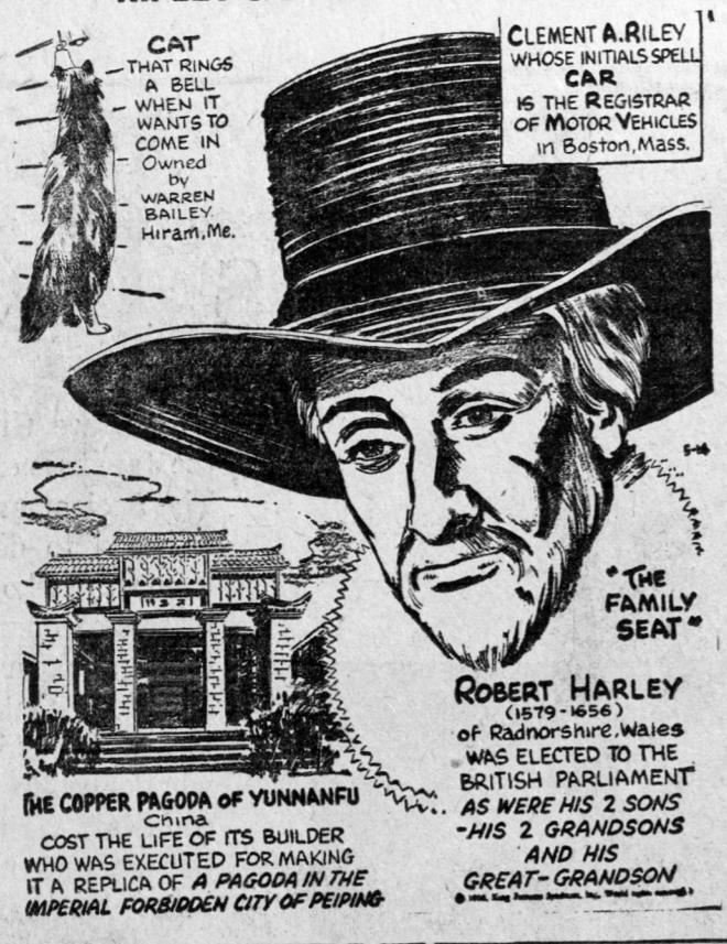
ROBERT HARLEY (1679-1656) OF RADNORSHIRE, WALES WAS ELECTED TO THE BRITISH PARLIAMENT AS WERE HIS 2 SONS - HIS 2 GRANDSONS AND HIS GREAT-GRANDSON.