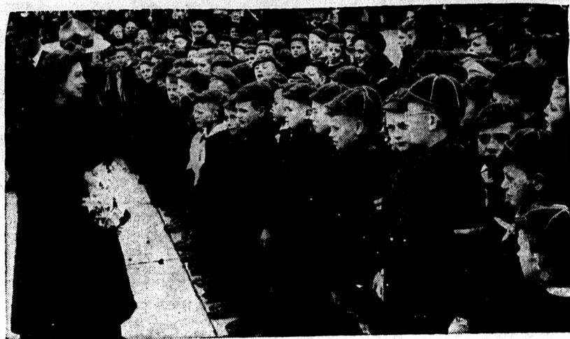
Princess Elizabeth inspects a group of Wolf Cubs, have had a large role in Western Canada's welcome during the Royal couple's visit to Regina. Children to the visiting Princess and her husband.