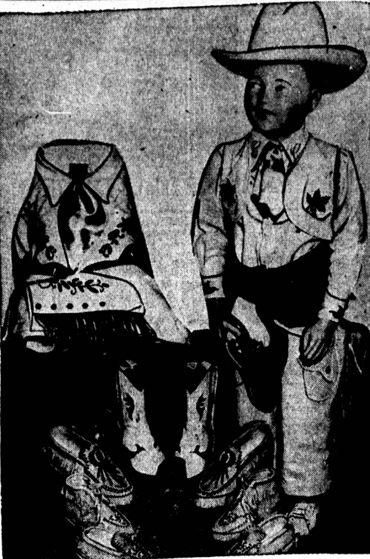
A COWBOY SUIT IS CALGARY'S GIFT TO PRINCE CHARLES

A child born on this day is bounteously and graciously blessed with those talents and charms for a life of the exceptional, romantic, adventurous.