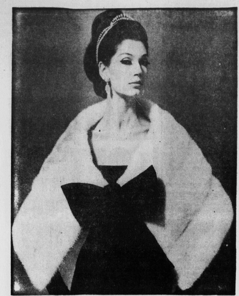
BEAUTIFUL BUT COOL CAPE COLLAR by Tom-ber, Elizabeth Taylor's favorite. It is in white mink and tied with a big black taffeta bow. Cape has pointed hems and was meant to make you