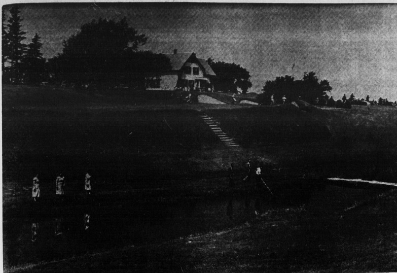
GREEN GABLES GOLF COURSE AT CAVDEN DISH IS AS FINE AS ANY IN MARITIMES