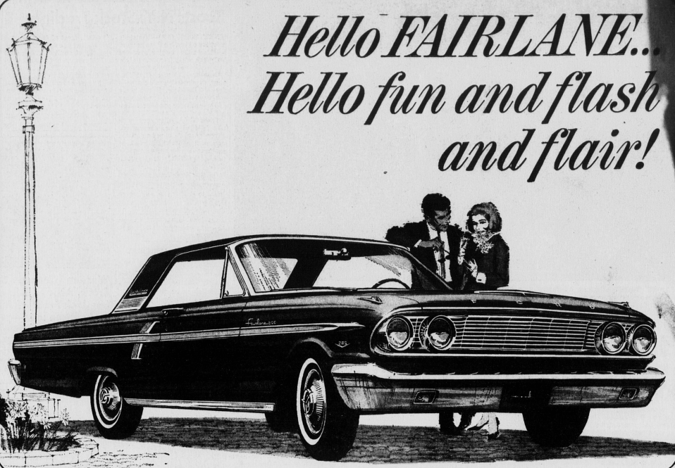
Fairlane 500 Sports Coupe, one of the Total Performance Fords Built in Canada

JAILS SOCIALIST LUCKNOW, India (AP)—The Uttar Pradesh legislature sentenced Keshav Singh of the opposition socialists to seven days in jail for contempt of its speaker. The socialist protested that only a court can give a jail sentence.