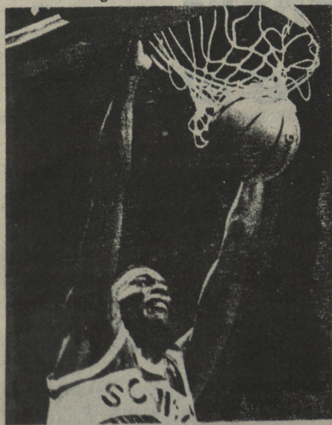
If at first you don't succeed... Perennial bridesmaid Shawn Kemp hopes to finally come out on top in the Slam-Dunk Contest.

This year's game, to be played in Minnesota, will be lacking certain elements that it had in