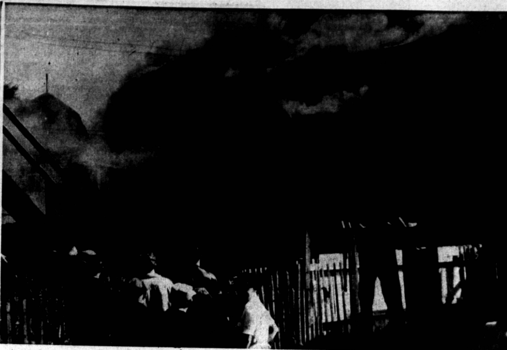
CITIZENS getting a close-up of the raging inferno that consumed three barns on Chestnut Street yesterday. This group formed only a small section of the large crowd that gathered to watch the blaze. The great volumes of smoke accompanying the destructive fire, blacked out that section of the city for a considerable time.

LONDON (CP)—The Financial Times says the problem of increasing British-Canadian trade boils down to finding a device for permitting both countries to discriminate against the United States. "In the old-fashioned world, that could be done by exchanging new preferences," the newspaper says. "In the world of GATT, it would equally well be done by exchanging preferences and calling them a free trade area." (GATT is the General Trade). The Economist welcomes the British proposal for an Anglo-Canadian free trade area but says the challenge should be directed as much at British agricultural policy as at Canadian industry policy. The magazine argues that the only way to save what remains of the Commonwealth preferential market in the older Dominions would be for Britain to reduce her agricultural subsidies in return for progressive removal of tariff barriers to other exports.