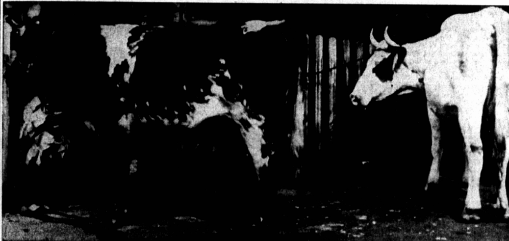
TWO OF THE cattle that yesterday morning's fire let loose on the city are shown tied up at a neighbor's fence, following their apprehension in a city-wide round-up. The animals are part of a herd owned by cattle-buyer Maurice Walsh, who lost two barns in the blaze.