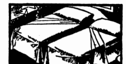
Or you may have twin beds each with an inner-spring mattress. A good idea for a boy's or girl's room.