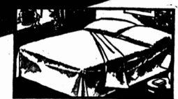
It opens easily to a wide double bed with comfortable inner-spring mattress. Ideal for the extra guest.

$5.00 DOWN and Ten Monthly Payments of $4.90. No Interest.