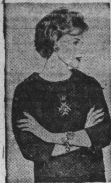
Worn high, front and center on an easy overblouse, heraldic pendant pin defines fashion's classic mood. Charm bracelet, button earrings repeat the pin's motif. By Coro.