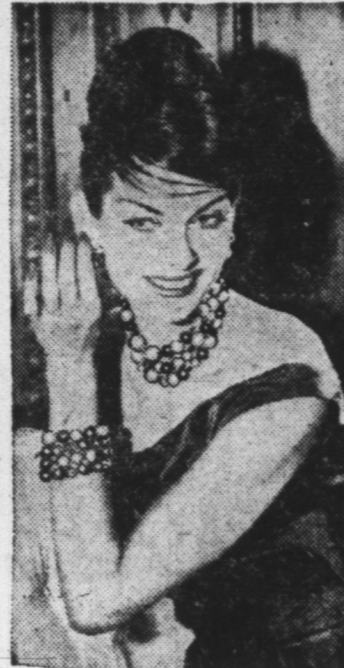
Elegant, luxurious and on fire with color are fall fashions in pearl jewelry. Shown here, the model wears a four-strand necklace that's a cluster of vibrant, exciting color around the neck and, to match it, a bracelet and earrings. All are designed by Richelieu.