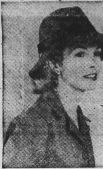
Choosing an up-to-the-minute fashion for fall, she wears a high-crowned, man-tailored hat with femininity revealed in the face-framing, curving brim. Equally aware of home fashion trends, she selects an electric clock with Pennsylvania Dutch design as a practical and decorative room accessory. "Dutch Treat" clock by GE-Telechron; hat by Emme.