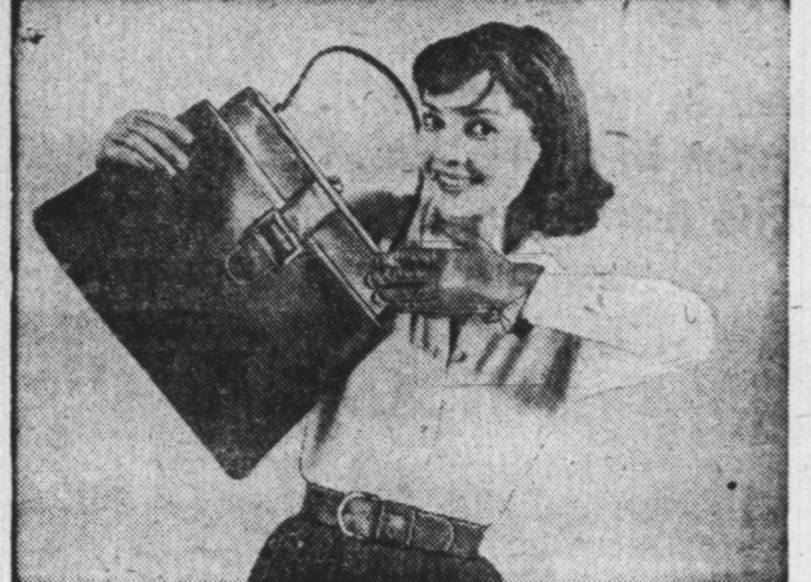
Three on a match is good luck in new fall leathers—for example, this handbag, belt and gloves in matching rich red, lightly grained leather. All have the well-tailored look, enhanced by discreet ornamentation—for the bag, a gold buckle on self-leather tab; for the belt, a heraldic emblem; for the gloves, lighter red leather foldover at cuff. Bag by Jana, belt by Dane, Launderer Leather gloves by Perrella.