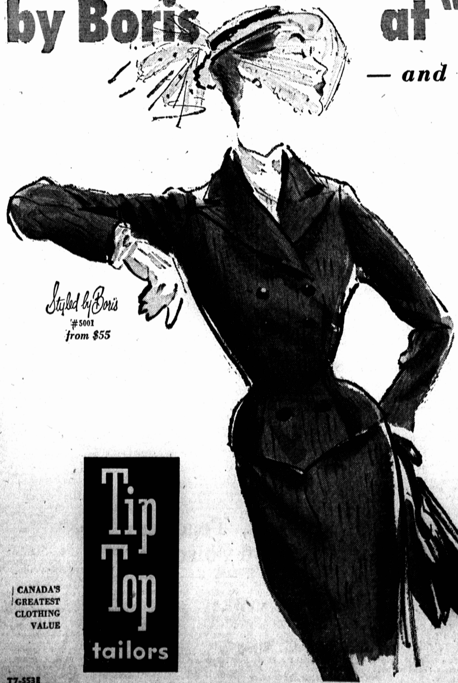
Styled by Boris #5001 from $55

— and "soft-tailored" to your measure by Tip Top Tailors