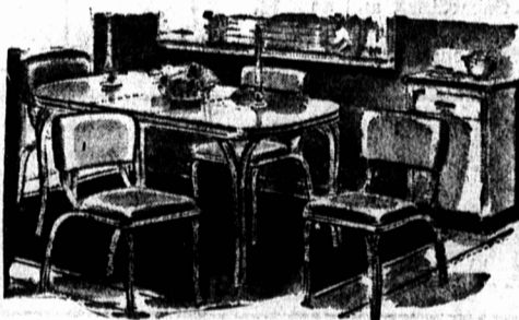
Ensemble Value No. 3