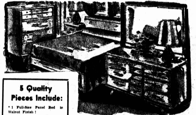
Ensemble Value No. 2